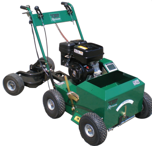
*9-HP shown with optional sulky